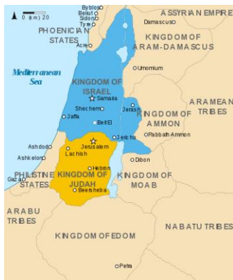
Map of Israel and JUDAH

JUDAH'S DESCENDANTS later BECAME THE TRIBE FROM WHICH KING DAVID CAME and IN WHOSE LAND JERUSALEM WAS LOCATED. JESUS CHRIST would also COME from THE TRIBE OF JUDAH ( Matthew 1:3 ).