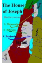
Map of the HOUSE of JOSEPH