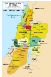
MAP SHOWING THE 12 TRIBES OF ISRAEL

Another example of a SUPERNATURAL PREDICTION in Jacob's blessing is found in his words to Issachar: "He saw that a resting place was good, and that the land was pleasant" (Genesis 49:15). Issachar's family would later inherit lower Galilee, including the Valley of Jezreel, which included rich, productive farmland.