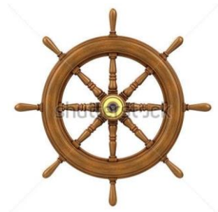
A Ship's Rudder

6 And THE TONGUE is [in a sense] A FIRE, the very world of INJUSTICE AND UNRIGHTEOUSNESS(wicked, sinful, evil); THE TONGUE is set among our members as that which CONTAMINATES the entire body, and sets on fire the course of our life [the cycle of man's existence], and is ITSELF SET ON FIRE BY HELL (Gehenna).