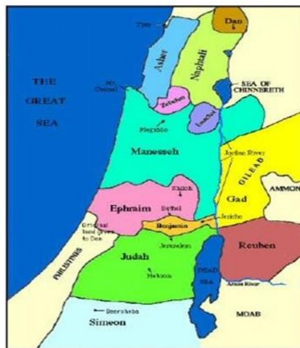
THE 12 TRIBES OF ISRAEL