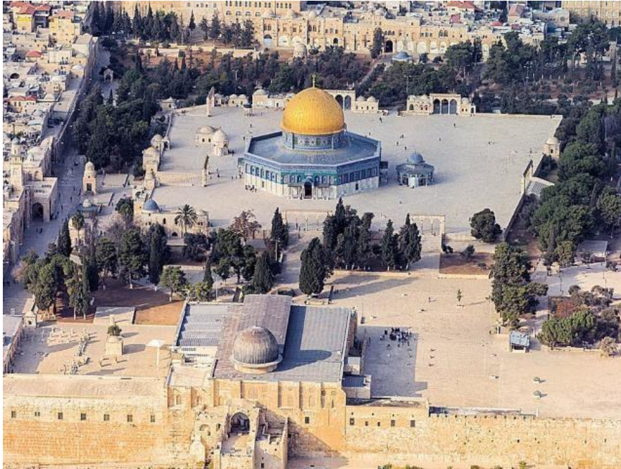
Picture of the dome of the rock in Jerusalem

Lucifer prophesy is going to be fulfilled through the anti-Christ: " I will sit also upon The Mount of the congregation, in the sides of the North, I will be like The most High. " Isaiah 14:13