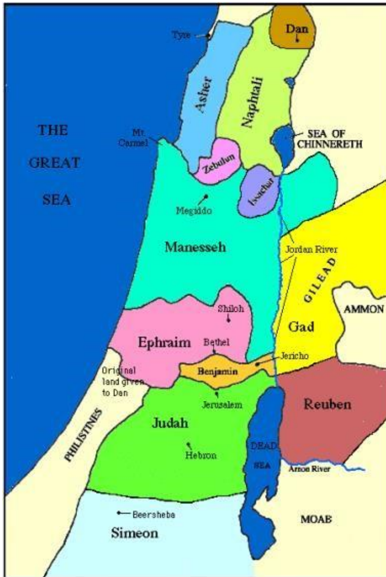
THE 12 TRIBES OF ISRAEL